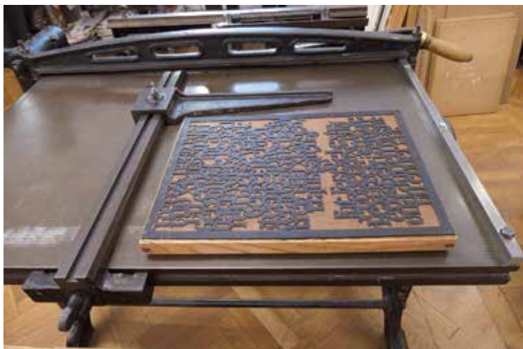
Laser-cut rubber material used as a block-out stencil on the papermaking mould, by artist Isabella Kohlhuber. Note the margin around the design so that the deckle can hold the stencil in place during sheet formation.