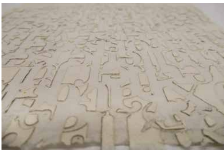
Detail of a "typorelief" cotton sheet made with a laser-cut stencil, by Isabella Kohlhuber.