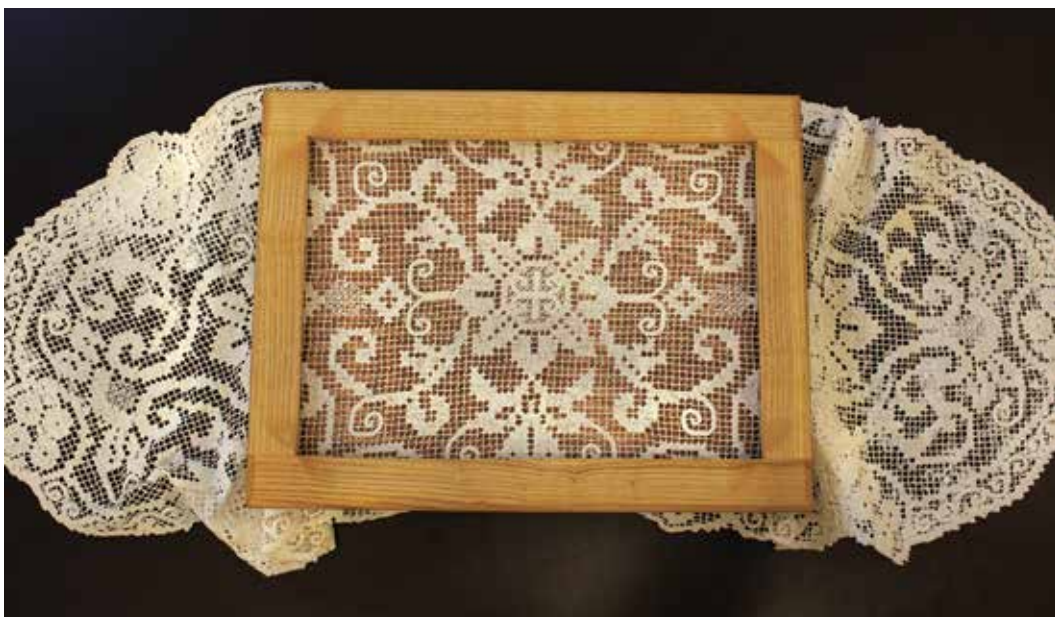
Sandwich a piece of lace between the mould and deckle for a watermarking effect, then leave the lace in place during pressing and drying to accentuate the lacy pattern on the surface of the paper.